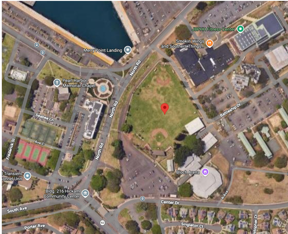
Ward Field (pin) with Bloch Arena directly to the south — the unified MWR programming footprint at the heart of JBPHH.